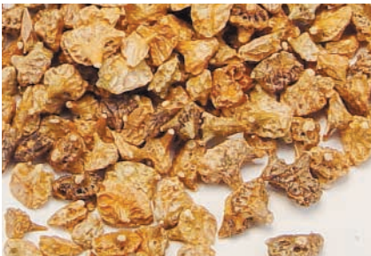
Bai Ji Li (Fructus Tribuli )