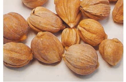
Bai Dou Kou (Fructus Amomi Rotundus )