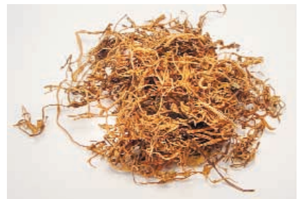
Ban Bian Lian (Herba Lobeliae Chinensis)