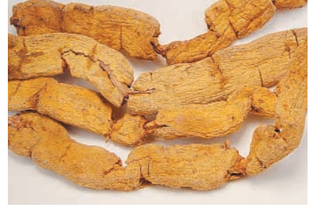
Ba Ji Tian (Radix Morindae Officinalis )