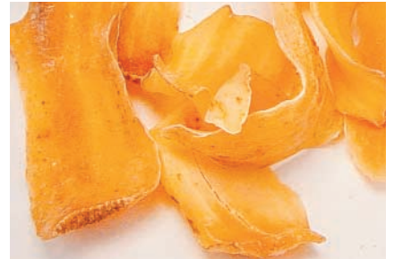
Bai He (Bulbus Lillii )