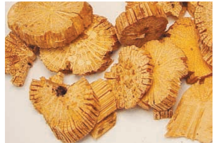
Bai Mu Tong (Caulis Akebia Trifoliata Australis)