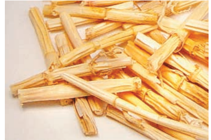
Bai Mao Gen (Rhizoma Imperatae)