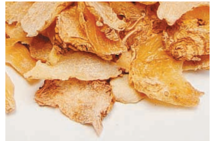
Bai Ji (Rhizoma Bletillae )