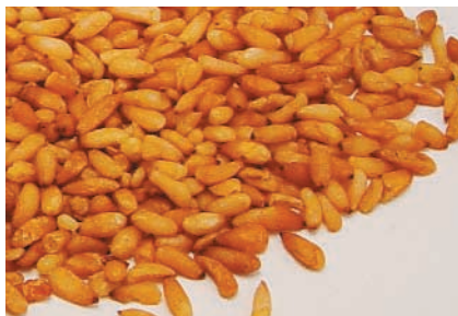
Bai Zi Ren (Semen Platycladi)