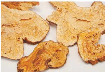
Bai Zhu (Rhizoma Atractylodis Macrocephalae)