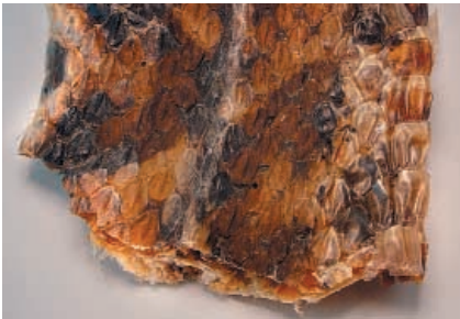
Bai Hua She ( Bungarus Parvus )