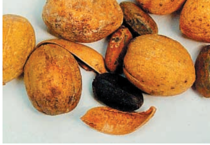
Ba Dou (Fructus Crotonis )