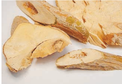
Bai Long Chuan Hua Tou (Radix Clerodendron Paniculatum)