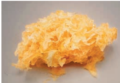
Bai Mu Er (Fructificatio Tremellae Fuciformis)