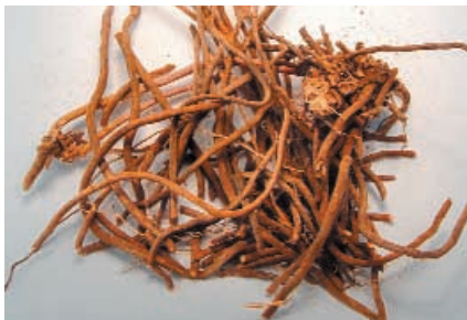
Bai Wei (Radix Cynanchi Atrati)