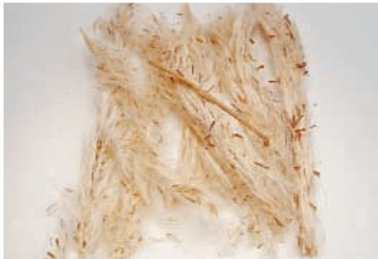
Bai Mao Hua (Flos Imperatae)