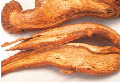
Bai Lian (Radix Ampelopsis)