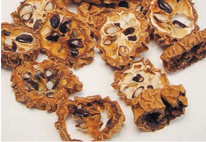
Ba Yue Zha (Fructus Akebiae )