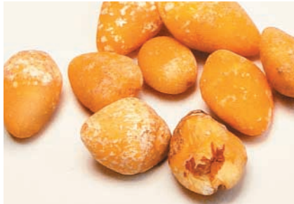
Bai Guo (Semen Ginkgo )