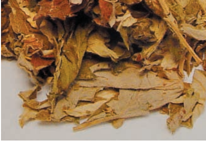
Bai Ye (Folium Artemisiae Argyi )