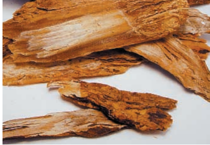
Bai Bu (Radix Stemonae )