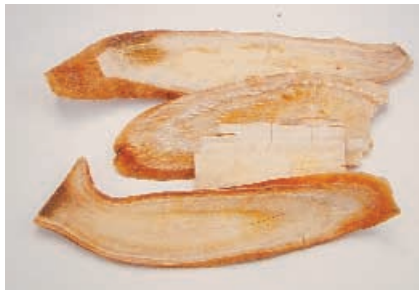
Bai Shao (Radix Paeoniae Alba)