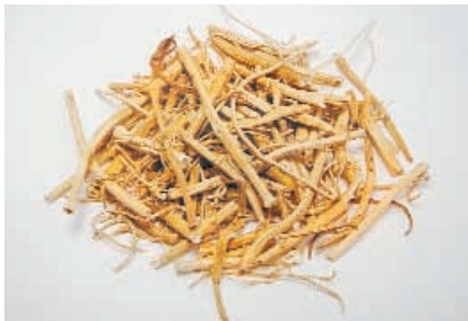
Bai Qian (Rhizoma Cynanchi Stauntonii)