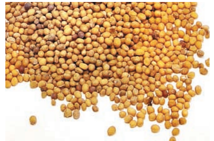
Bai Jie Zi (Semen Sinapis )