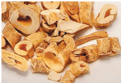
Bai Xian Pi (Cortex Dictamni)