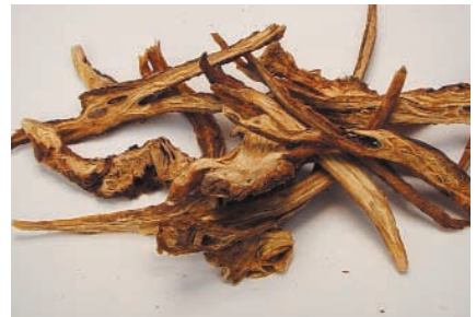
Bai Tou Weng (Radix Pulsatillae)