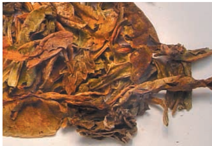
Bai Jiang Cao ( Herba cum Radice Patriniae )