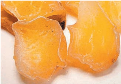
Bai Fu Zi (Rhizoma Typhonii )