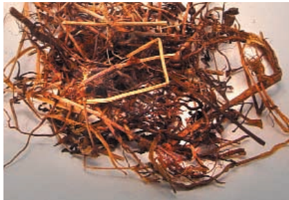
Bai Hua She She Cao ( Herba Oldenlandia )