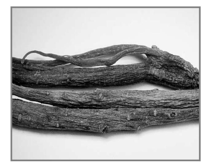
Pinyin Name: Ren Shen Literal Name: "man's plant," "man root" Alternate Chinese Names: Gui Gai, Yi Shan Shen, Chao Xian Shen, Ren Xian Original Source: Shen Nong Ben Cao Jing (Divine Husbandman's Classic of the Materia Medica) in the second century English Name: ginseng, ginseng root Botanical Name: Panax ginseng C. A. Mey. (Ren Shen) Pharmaceutical Name: Radix Ginseng Properties: sweet, slightly bitter, slightly warm Channels Entered: Lung, Spleen